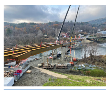
CLIENT • Vermont Agency of Transportation DATES