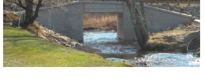
Old Marlborough Road over Charcoal Brook NHDOT #14928, FEMA-1695-DR-NH Dublin, NH

The project includes crossing of the emergent wet meadow area of the former Merrimack Village Dam (MVD) and repurposing of the MVD's extant head gate structure, power canal and granite stone canal arch of the historic Chamberlain Bridge to facilitate a crossing under U.S. Route 3.