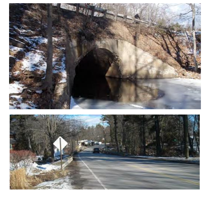
US Rte. 3 over Baboosic Brook NHDOT #29174 | Merrimack, NH

This Project is in Preliminary Design: Engineering Study with Alternatives Evaluation; Coordination of Relocation of Aerial Utilities, Underground Communications Gas, & Water currently ongoing; FEMA BRIC Grant BCA for outside funding completed; Historical Resource coordination completed, and Natural Resource coordination is ongoing.