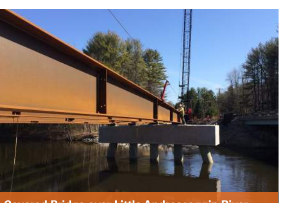
Covered Bridge over Little Androscoggin River