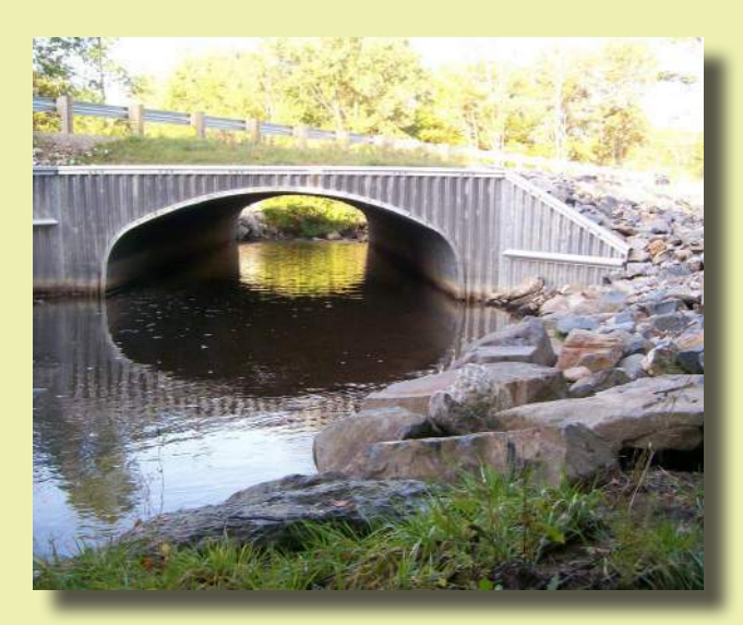
Chesley Hill Road Bridge After Reconstruction Rochester, New Hampshire