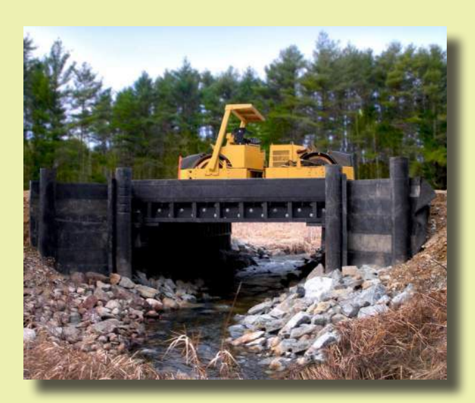
Birch Hill Road Culvert Replacement York, Maine